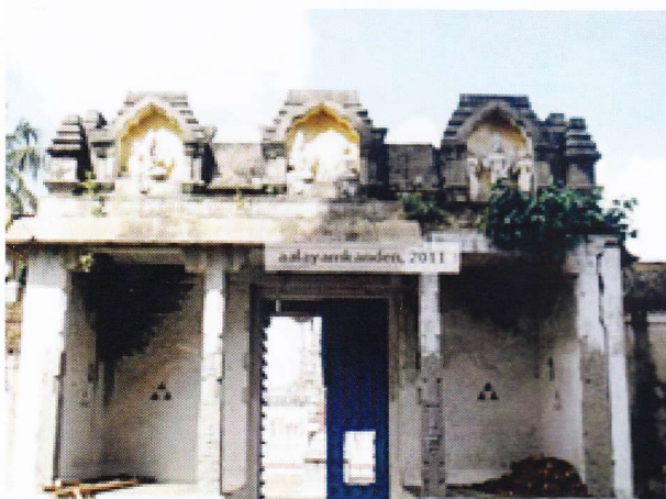
Sithukadu Sri Dhatriswara Temple