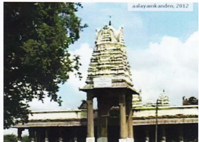
Sanjeeviraya Hanuman Temple, Iyyangarkulam