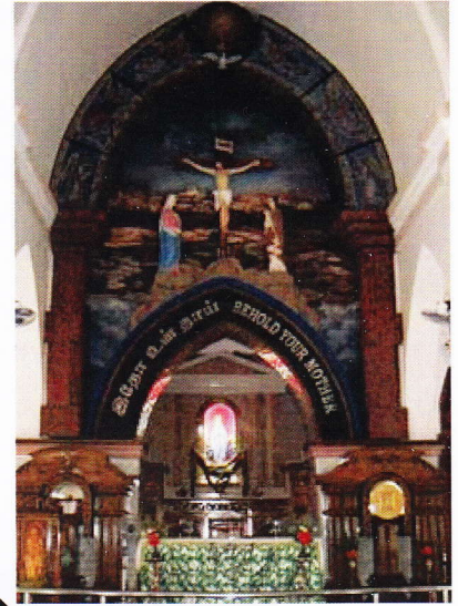
Poondi Madha Basilica