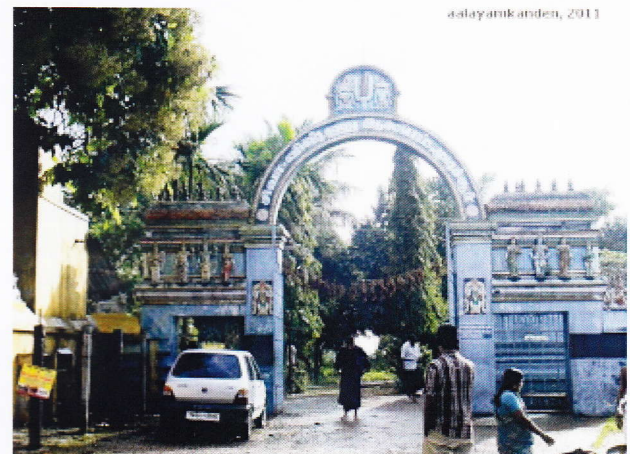
Siva Vishnu Temple, Mudichur