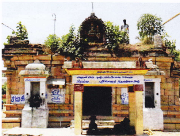
Sri Brahmapureswarar Temple, Kizhakurukkai