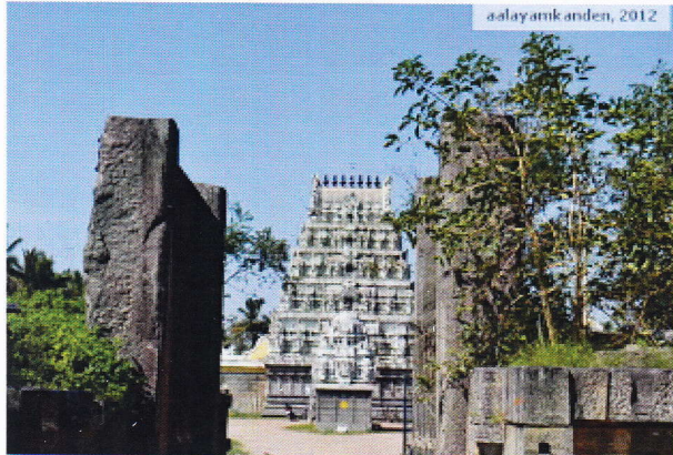
Sri Kribapureswarar Temple, Thiruvannainallur